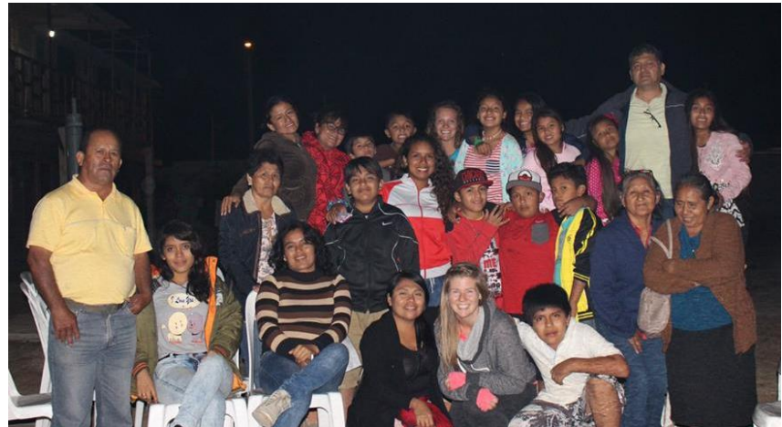
The Staff at Morningstar

The employees of the Peruvian Judicial system are once again on strike so there is no advancement in any of the Morning Star cases.